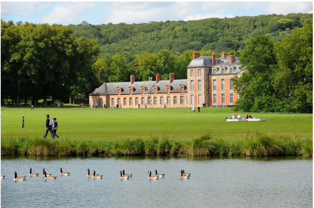
Departmental Domain of Chamarande

Spend an afternoon or a day at the Domain of Chamarande and you'll get a breath of art, a breath of fresh air, and a big breath of Essonne. Throughout the year the Domain has something to offer to each and everyone, with a continually changing range of educational and leisure activities that testify to the cultural vitality of the Department of Essonne.