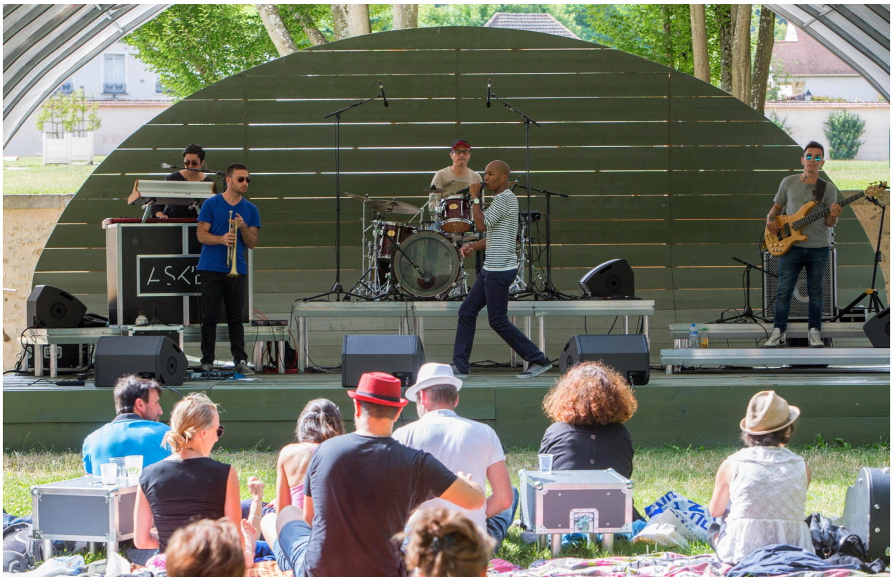
Ask'Em Concert, 2017