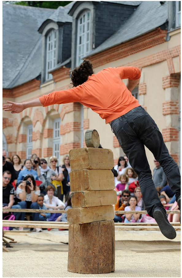
Cirque Galapiat, 2016