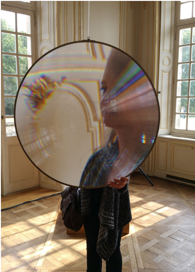
Corps narratifs, 2016