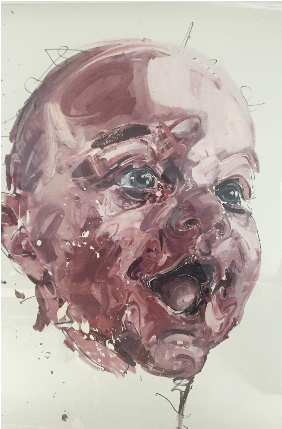
Orso, 2015, 180 x 160 cm, oil on canvas © Philippe Pasqua

The exhibition saw Pasqua create ambitious works in collaboration with some of the world's best craftsmen.