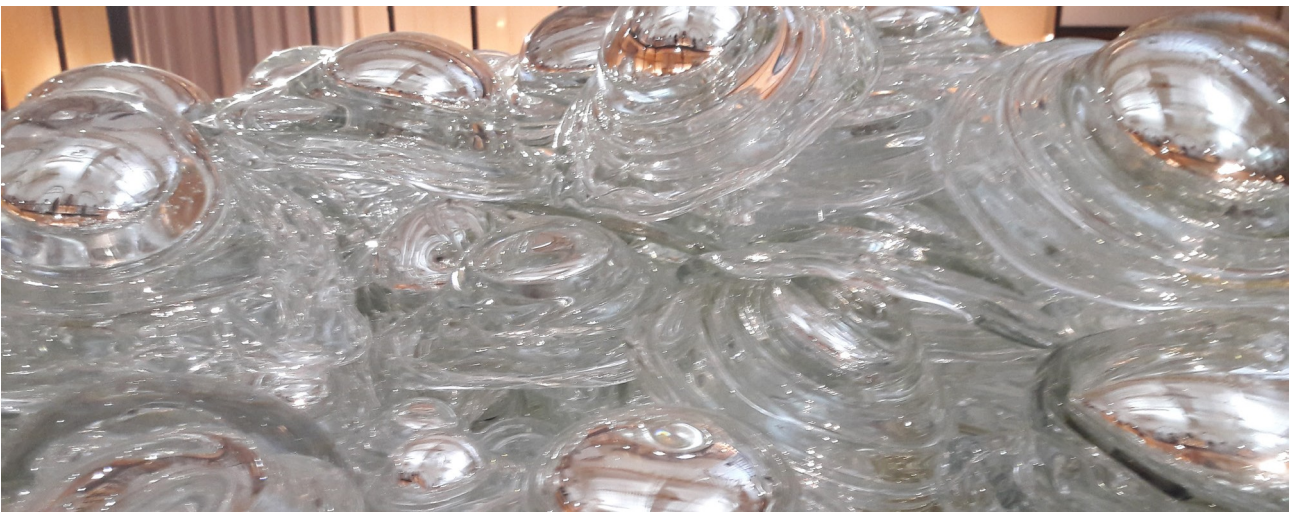
Detail from Le chant des méduses, 2016, 400 x 220 x 150 cm, containers in metal, glass, various materials © Rights reserved

The Departmental Domain of Chamarande, with its 17th-century castle, 18th-century orangery and the greenery of its park are the perfect environment to host the first major French exhibition of contemporary artist Philippe Pasqua. This exceptional setting is an enchanting showcase for the dreamlike, symbolic universe of the artist's paintings, drawings, collages and monumental sculptures.